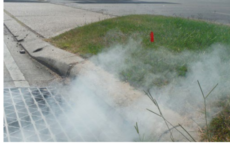
Identified Cross Connection