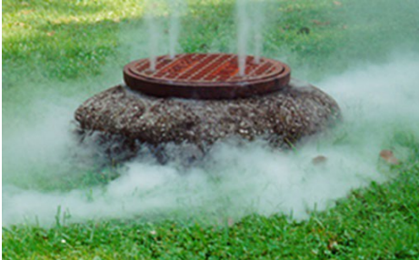
Leaking manhole chimney/Cover