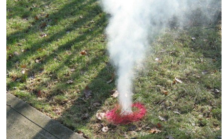
Identified broken clean-out

SUMMARY: USSI LLC is under contract by The City of Daytona Beach Utilities Department to smoke test 44.87 miles of sanitary sewer gravity mains located within the beachside service area.